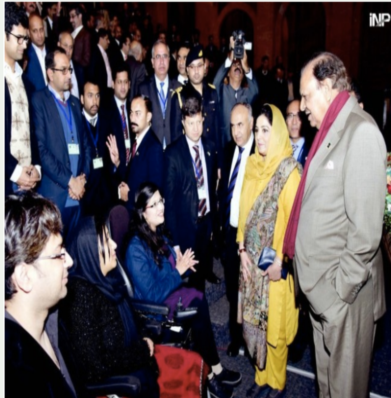
President Mamnoon Hussain interacting with special students during the ceremony of Pakistan Mobile App awards.