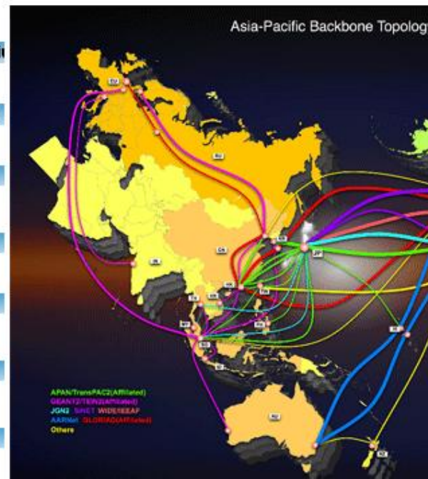
The TEIN2 Network